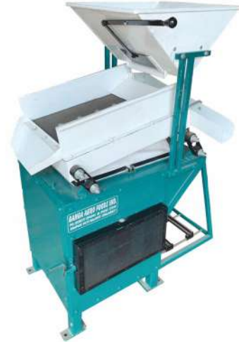
Destoner No. 2