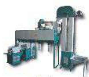
800kg Cleaning Machine

Perfecting in CLEANING & GRADING of all kinds of seeds, grains, spices, pulses and oil seeds.