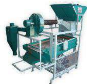
4 x 2 Flat Grader With Cleaner blower system