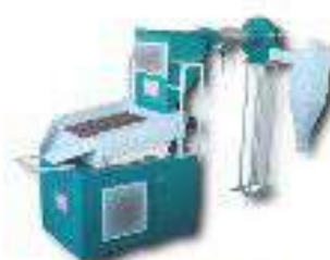
Destoner With Cleaner Blower