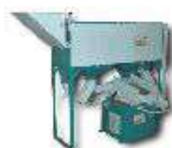
Small Cleaning Machine