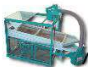
6x2.5 Hat Grader With Jibhi Blower