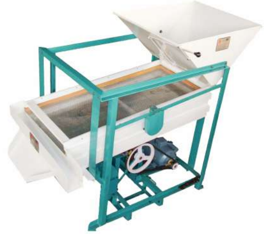
4x2 Flat Grader