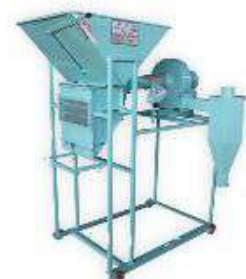
Cleaner & Blower