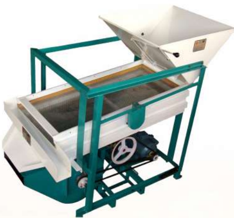
4x2 F.G. With Fan