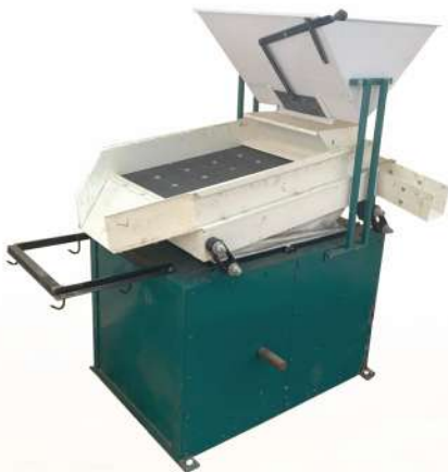
Destoner No. 3