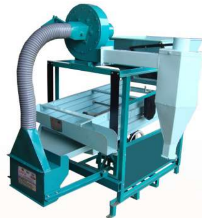
4x2 F.G. With Suction Blower System