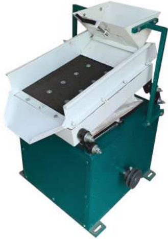
Destoner No. 1