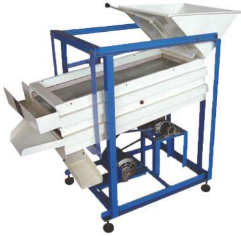
3x1.5 Flat Grader