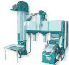
500kg Cleaning Machine