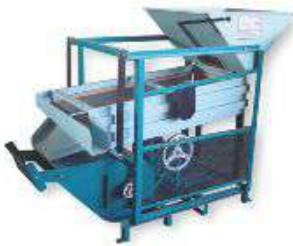
4x2 Flat Grader With Fan