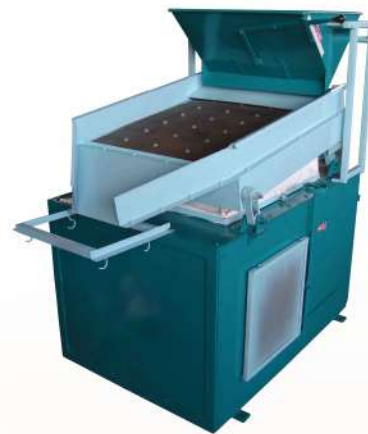
Destoner No. 4