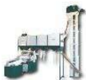
1200kg Cleaning Machine