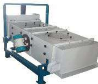
MTR (Vibro Grader)