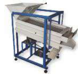
3X1.5 Flat Grader